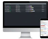
NetRelay Messaging Console/Clinician's Smartphone